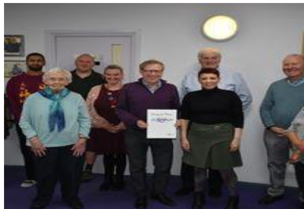
Visit From AUK England CEO, November 2022