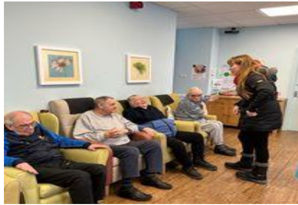
Client and Customers 2023 Angela Raynor MP, in the 131 Club, March 2023