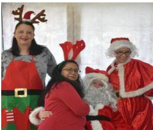
Staff Getting Ready for Christmas Party Season 2022