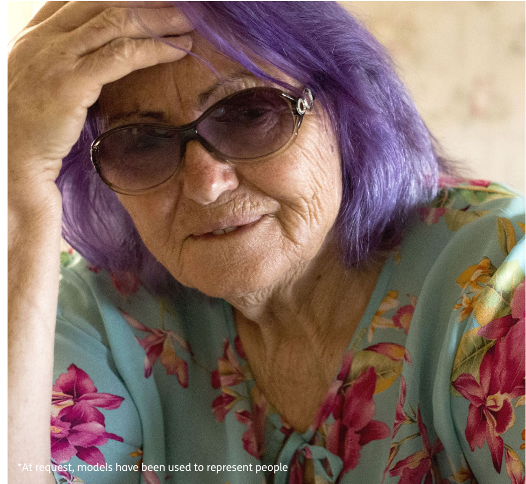
*At request, models have been used to represent people

“After her health went downhill following a catastrophic fall my Mum was given only weeks or short months to live, but in the end she survived for more than three years. I’ve no doubt that’s because she received really good social care, delivered by committed staff who came to know and love her. Good care saves lives.”