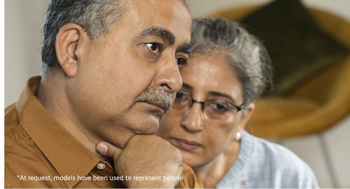
*At request, models have been used to represent people

a suitable bed in a home near their loved ones often then live in fear that once their money runs out they will be forced to leave, as the costs are higher than the small budget their local authority can afford to allocate for their care.