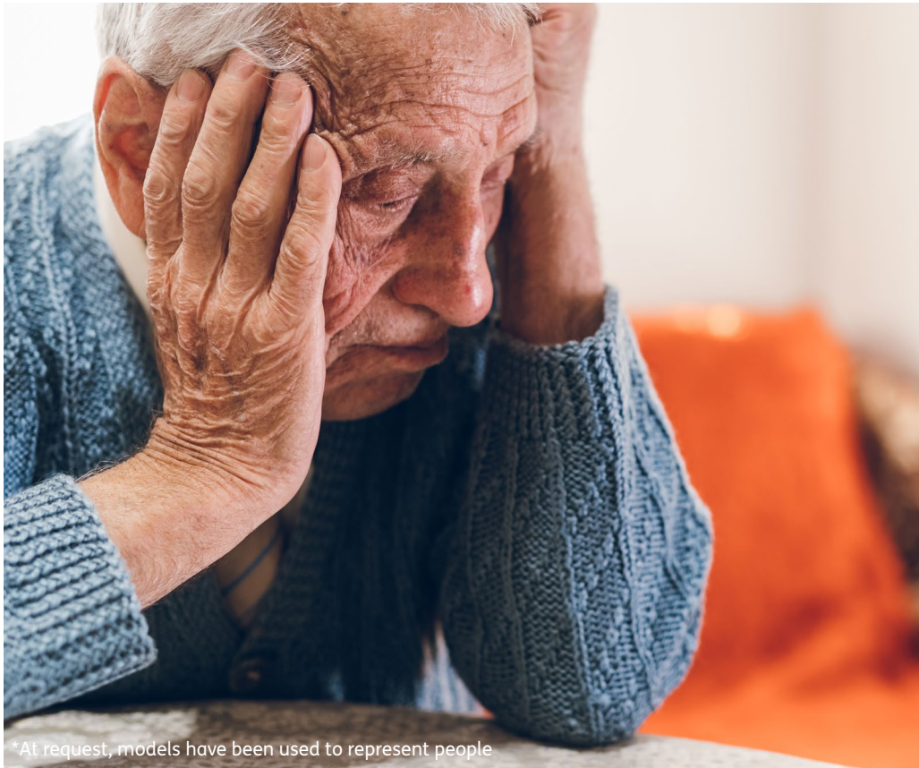
*At request, models have been used to represent people

situation will get even worse when the Government's new social care cap and Fair Cost of Care measures start to be introduced in 2023. Although we welcomed these reforms, not enough has been done to increase the capacity of councils to deliver them, and the problem is that they are bound to lead to more people asking for assessments, thereby adding to an already lengthy queue.