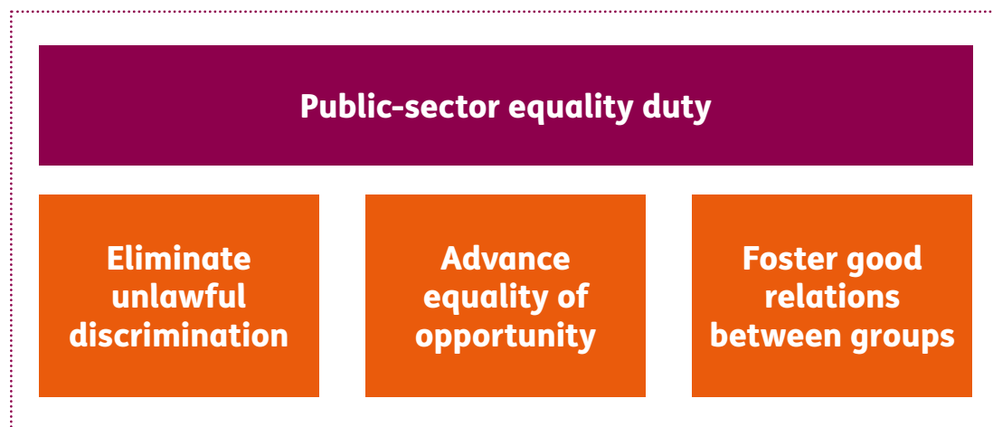
Figure 1 The structure of the equality duty

The duty covers the following eight protected characteristics: age, disability, gender reassignment, pregnancy and maternity, race, religion or belief, sex and sexual orientation.