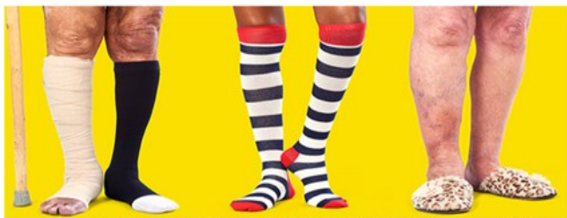
CHEADLE HULME LEG CLUB

Do you or a family member suffer from leg ulcers or lower limb issues?