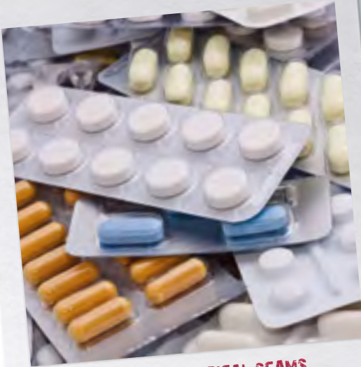
HEALTH AND MEDICAL SCAMS

Try the most powerful weight loss formula