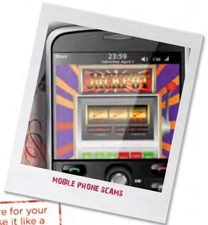
MOBILE PHONE SCAMS