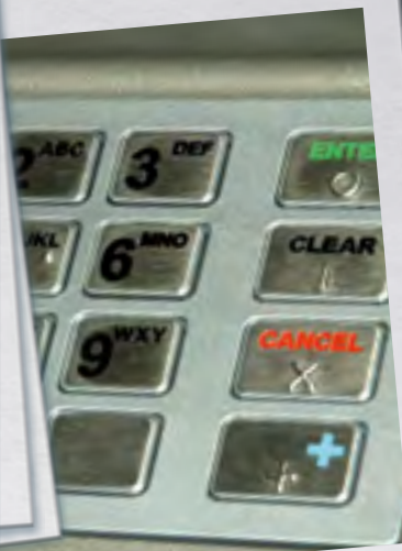
BANKING AND PAYMENT CARD SCAMS