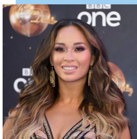
Strictly's Katya, dancer and choreographer who won the competition with Joe McFadden in 2017

We're delighted that we'll be joined by Strictly Come Dancing's Katya Jones plus actor Carolyn Pickles who's starred in Emmerdale, The Bill, Broadchurch and Harry Potter