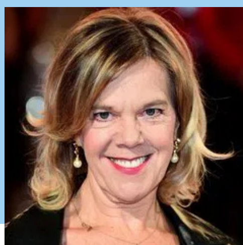
Actor Carolyn Pickles