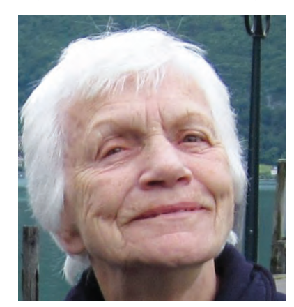
This is a chargeable Welfare Service If you are over 50 please contact us.