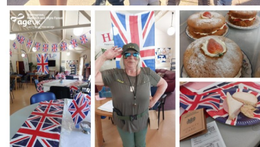
Friendship Group VE Day Celebrations