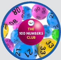
We have 50 members taking part

Simply visit our website or stop by Jubilee reception and grab a registration pack. Complete the simple form, return it to us and get ready for the upcoming draw. Wishing you luck!