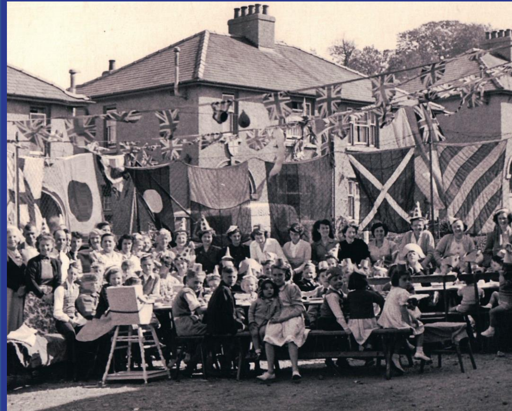
Coronation 1953 by Adrian Marriette Coronation 1953 | Guemsey 1953 Rougeval Street Party to rel... Flickr

Groceries were delivered with an overbook from the previous week, milk on a horse and cart or tractor. Clotted cream and parties were popular. Swimming sports were held in Charlestown harbour. We cycled to the beach downhill there and very uphill back!