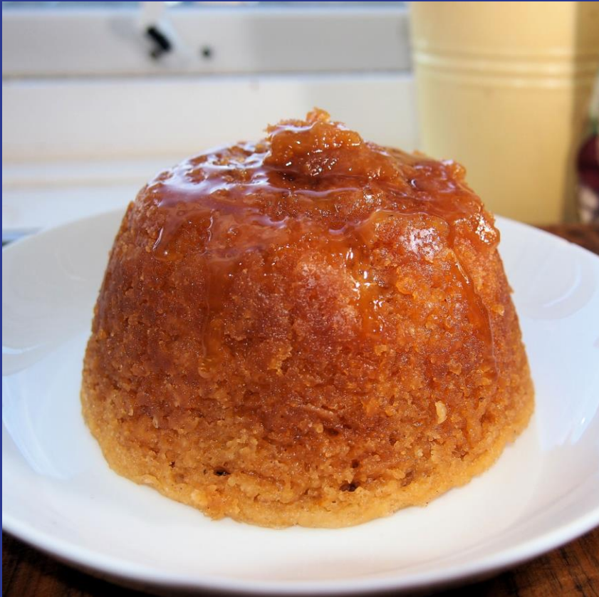
pudding by Lamerie pudding | a proper one, made with suet, it was nicer than it... | Flickr