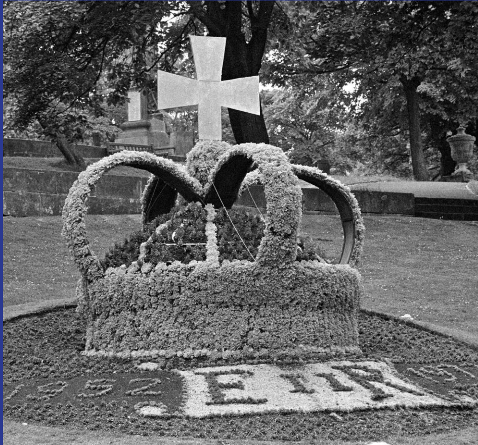
Derbyshire 1977 by pszz Derbyshire, 1977, 1 Queens Silver Jubilee, 1 pszz | Flickr