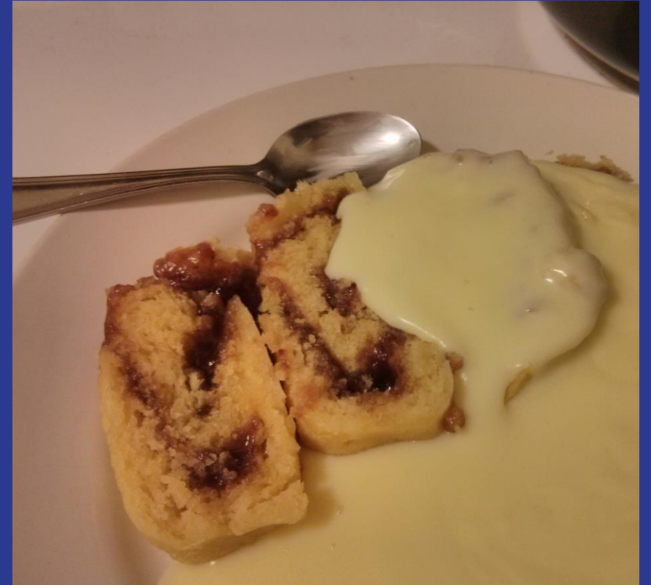
Jam roly-poly & custard by Simon Tunbridge jam roly-poly & custard | Simon Tunbridge | Flickr