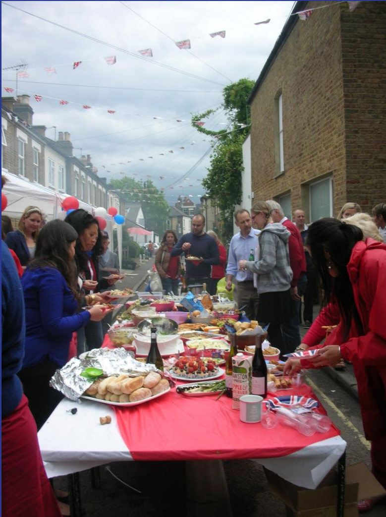
Watt Lane Golden Jubilee Street Party 001 Watt Lane Golden Jubilee street party 001