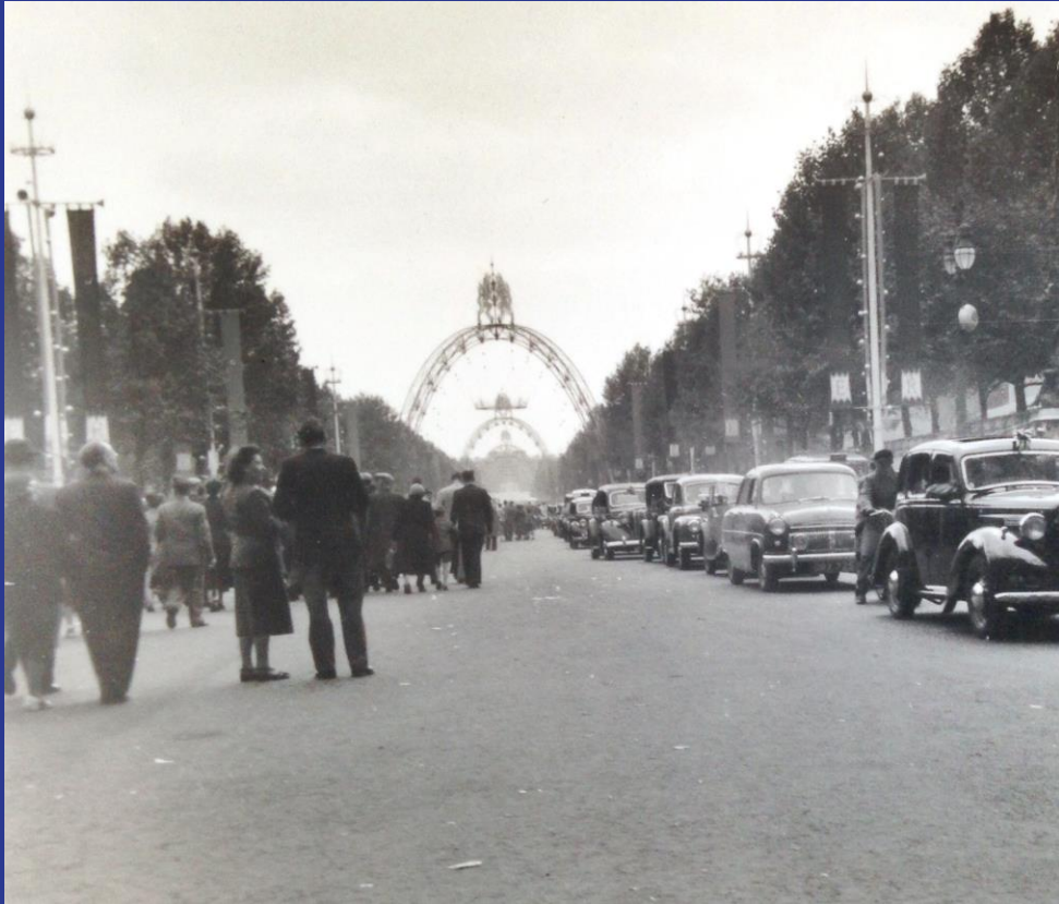
The Mall- Coronation of Queen Elizabeth II by Paul James The Mall - Coronation of Queen Elizabeth II | Family photo taken on Flickr