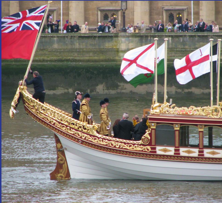
Diamond Jubilee Pageant 034 diamond jubilee pageant 034 | One thousand boats on the Thames