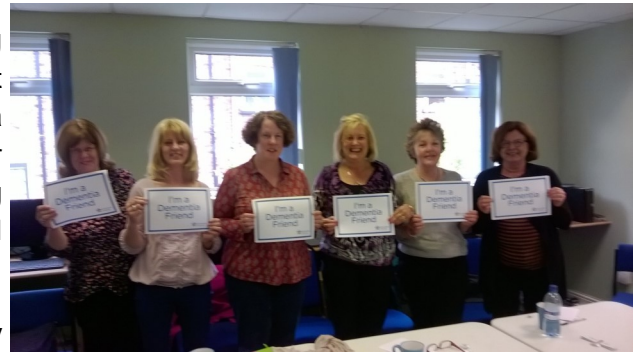
Six more staff become dementia friends

As a charity, we work with many people who either have dementia or care for someone who has, so it is vitally important that all our staff and volunteers are aware of some of the issues faced by people living with dementia so that we can tailor our services accordingly!