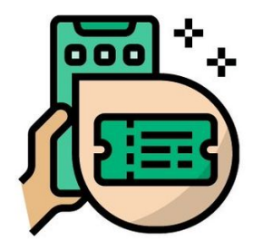
You find tickets online to a popular event.

The scammers play on the fact that the number of tickets is limited and they are in demand. This leads them to pressure people into buying tickets without completing the necessary checks to make sure they're genuine.