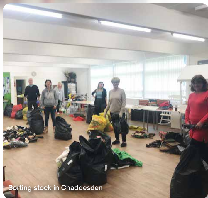
Sorting stock in Chaddesden