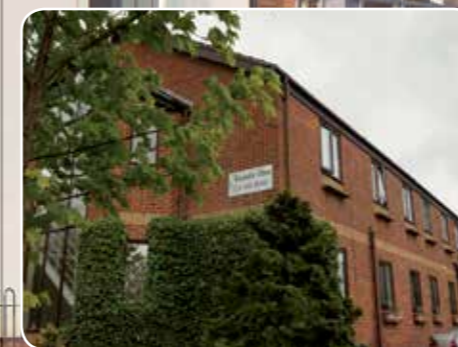
ALEXANDRA HOUSE Eastwood, NG16 3GP