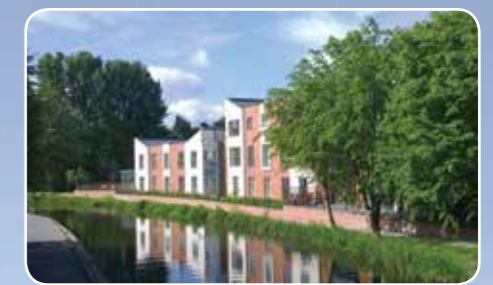
CANAL VUE (Residential Home, with Dementia Care) Ilkeston, Derby DE7 8JF