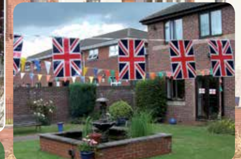
MELBOURNE HOUSE Aspley, NG8 5RU