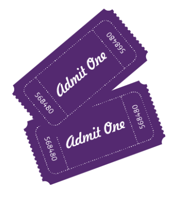
Put on a show