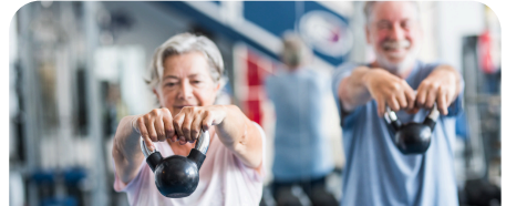
Body Strength Training