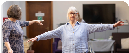
Balance & Bone Health