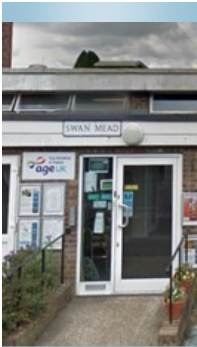
Opened in 1974, Swan Mead Day Centre, Queens Road our home for 45 years