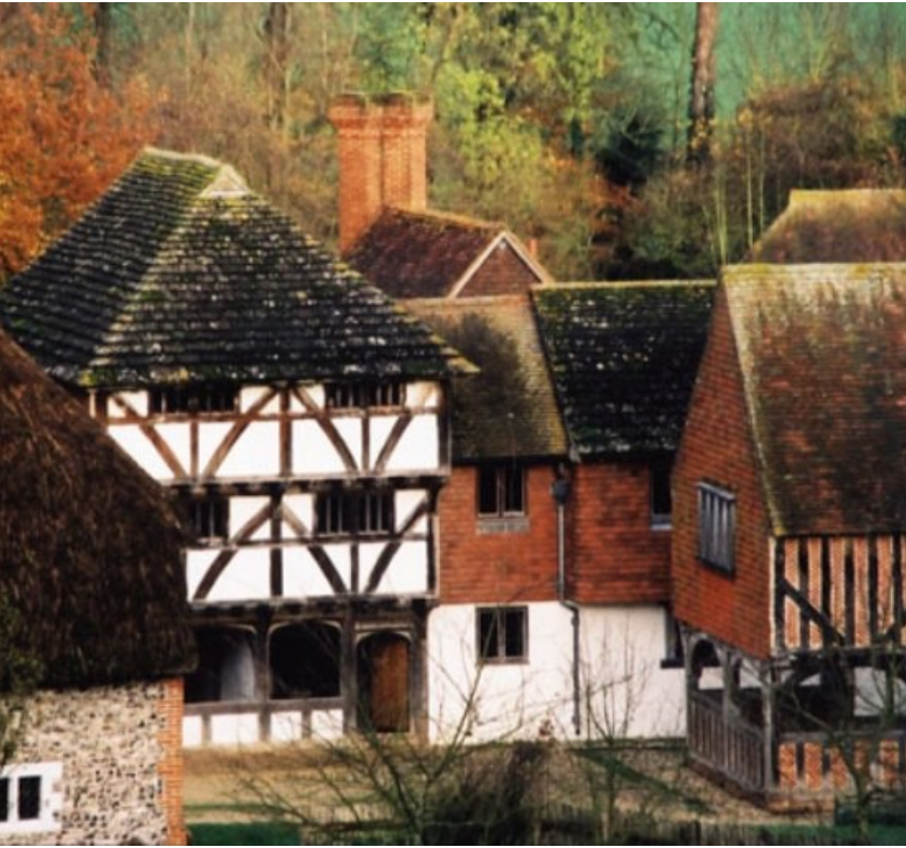
One of the places we visited during the year Weald & Downland Living Museum