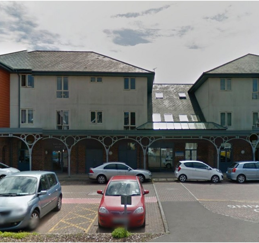
The Glen Vue Centre., Railway Approach