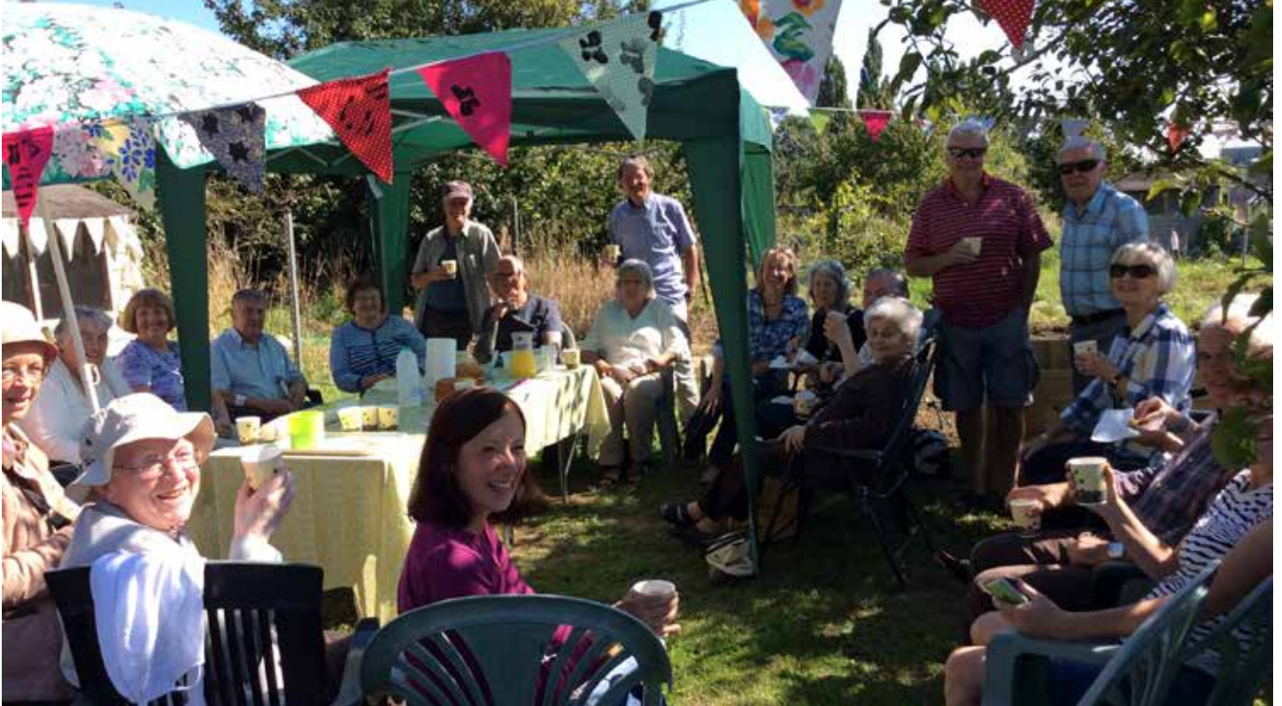
Our Budding Friends Group