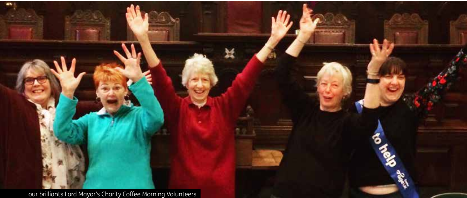
our brilliants Lord Mayor's Charity Coffee Morning Volunteers