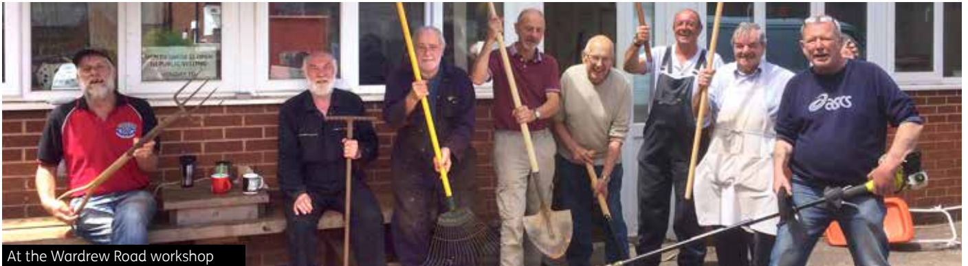
At the Wardrew Road workshop

Age UK Exeter started its 'Men in Sheds' project in 2012 due to the lack of activities available to older men in the city