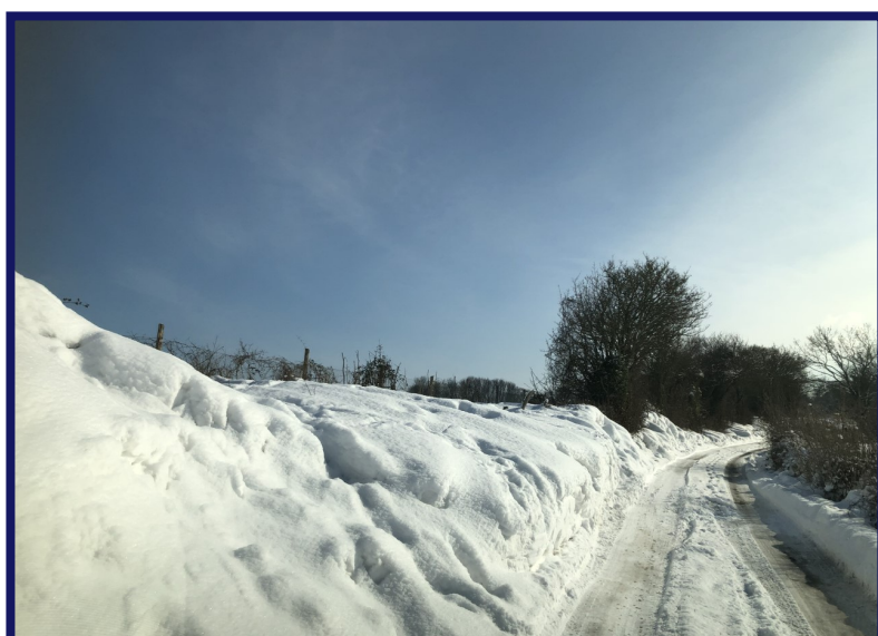
The snowy covered roads that our drivers had to negotiate.