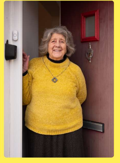
Charity number: 1187363