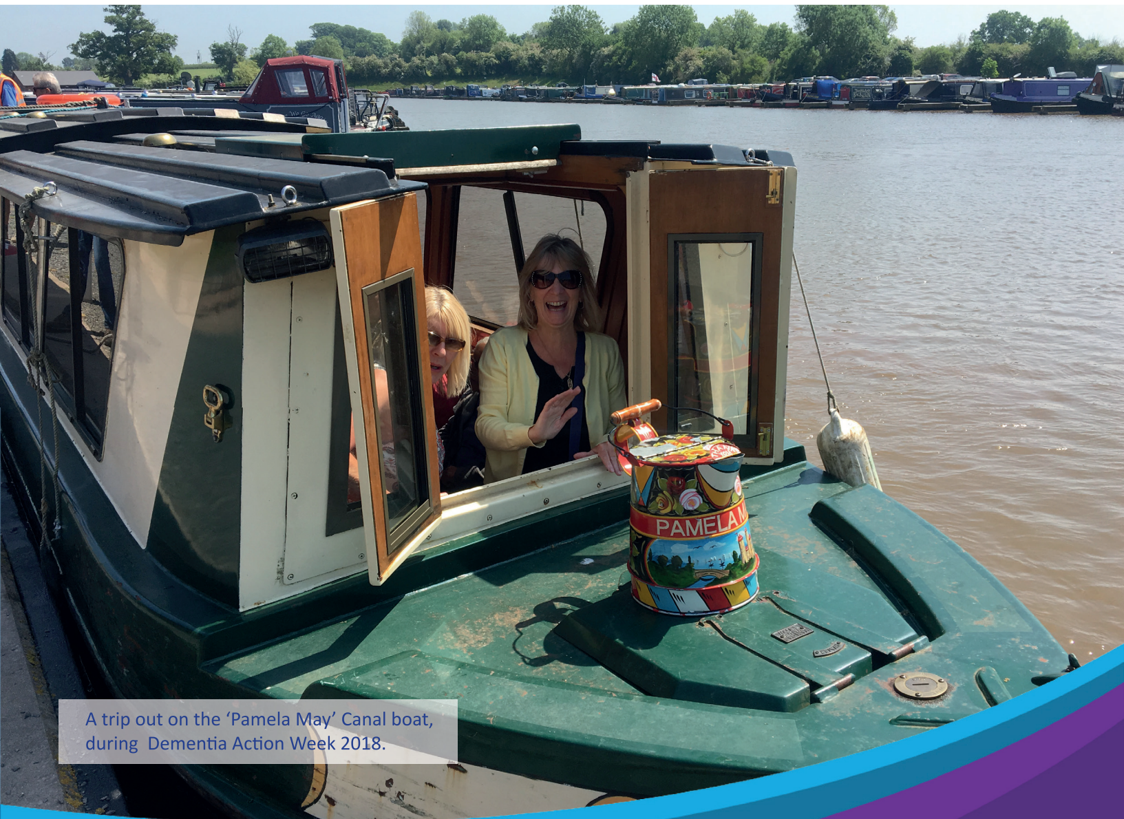
A trip out on the 'Pamela May' Canal boat, during Dementia Action Week 2018.