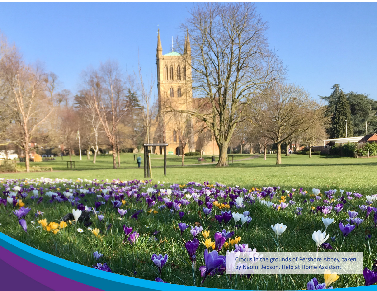
Crocus in the grounds of Pershore Abbey