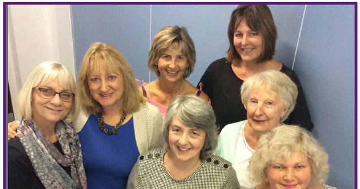
Our fantastic Associate Trainers