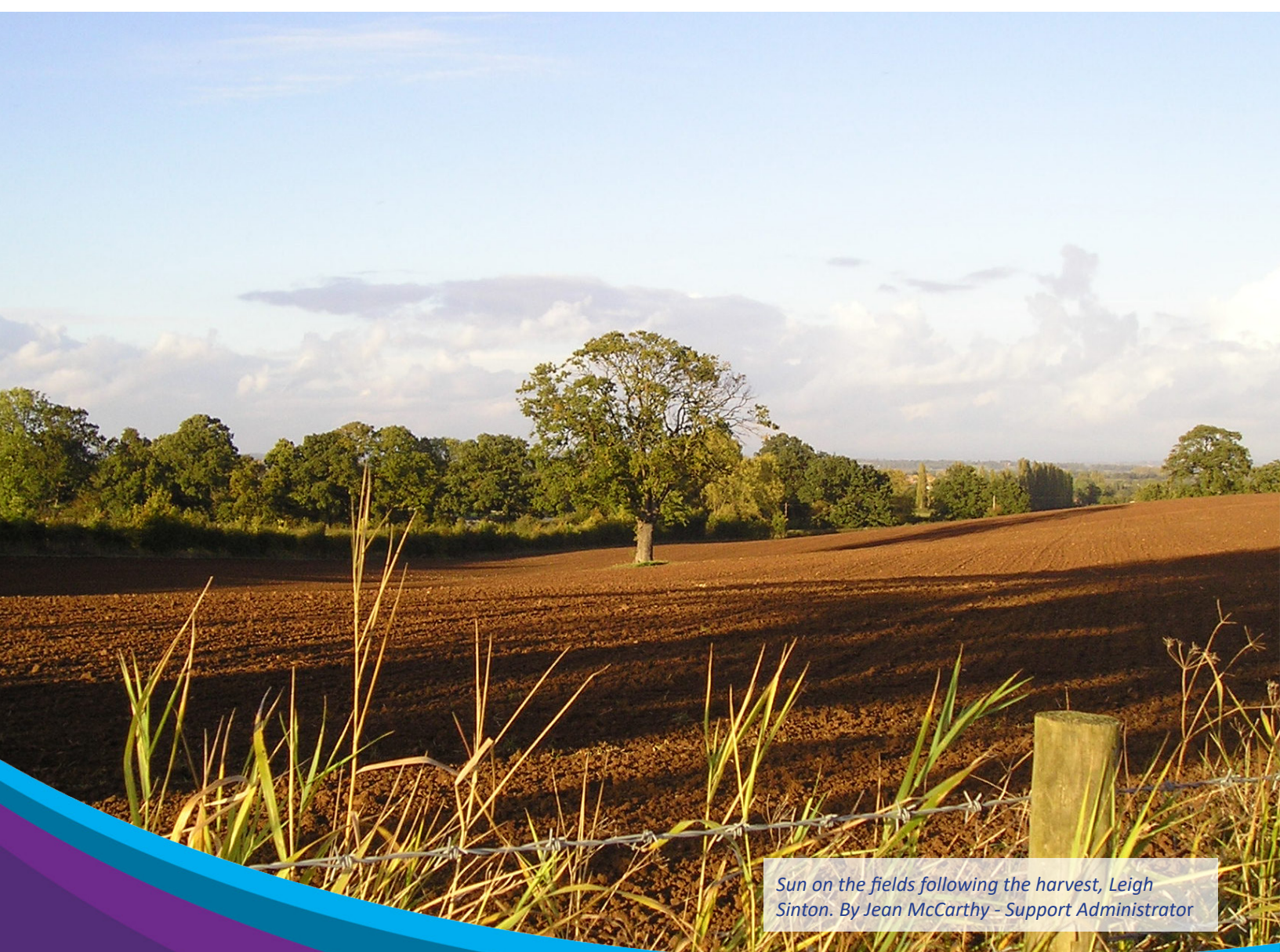
Sun on the fields following the harvest, Leigh Sinton.