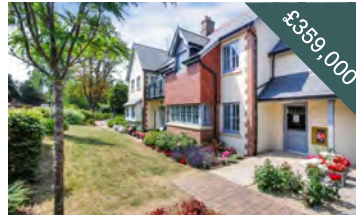
£359,000 Silver Sands, Bembridge Two Bedroom | First Floor | Balcony | Sea Views