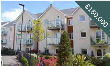
£150,000 Somers Brook Court, Newport One Bedroom | First Floor | Guest Suite | 24 Hour Careline