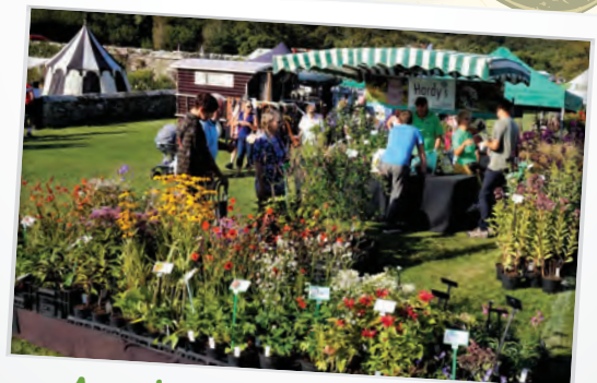
Amazing Island and mainland nurseries and gardenalia stalls!