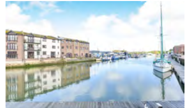
Medina Court, Newport Contact us to register your interest for this development.

To find out more about our developments, call 0345 556 4105 or email resales@mccarthyandstone.co.uk