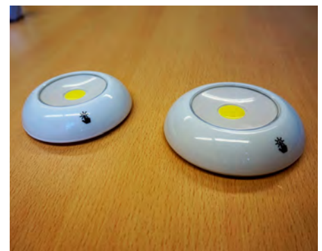
Self adhesive battery operated lighting; for extra lighting without the need for wires