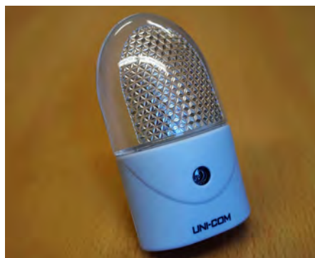
Movement-activated nightlights; offering middle of the night peace of mind