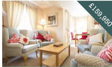
£159,950 Somers Brook Court, Newport One Bedroom | Ground Floor | Patio Doors Leading to Gardens