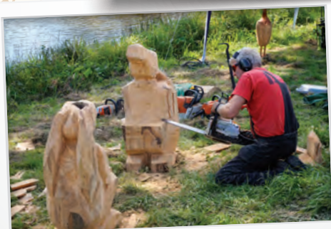
Country arts, crafts, Farmers' Market, stalls and demonstrations