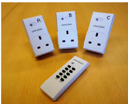
Easy to setup up remote control sockets; no more bending to remove awkward plugs

Below are some examples of easy to use technological equipment that can help to give you peace of mind around the home. All of the below, and more, are available to be installed by our Digital at Home service.