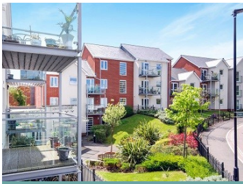
Somers Brook Court, Newport