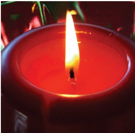
CANDLES/HEATING Pages 8 and 9