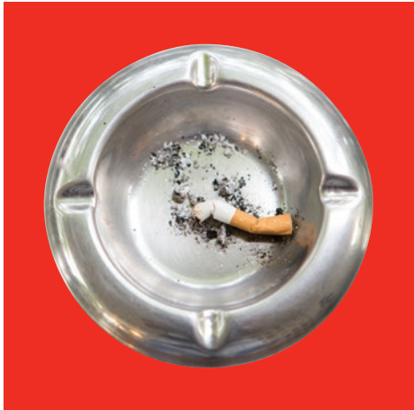
SMOKING Page 3