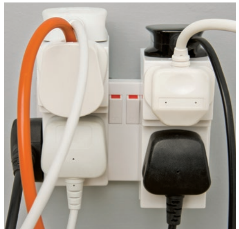
ELECTRICS Page 11