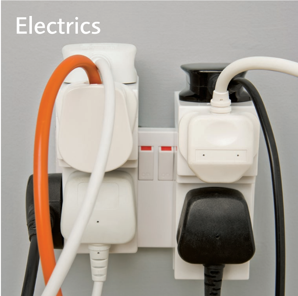
Don't overload plug sockets. Keep to one plug per socket.