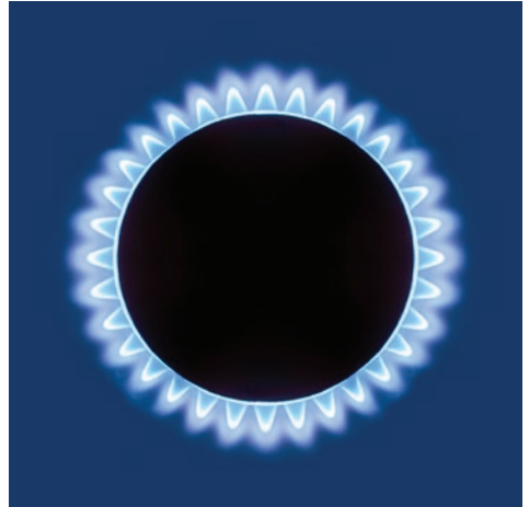
COOKING Page 5