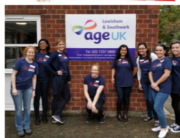
Hands on London