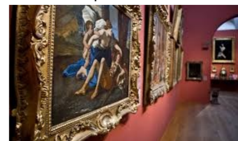
Gallery Trip on 5th December.