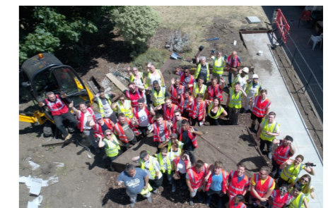
WDI Trainee Challenge