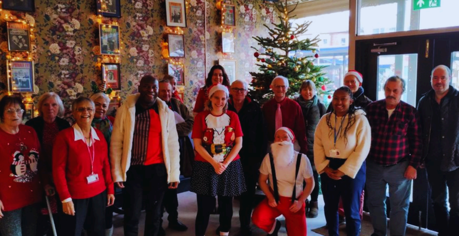
Volunteers Christmas Party, 2022