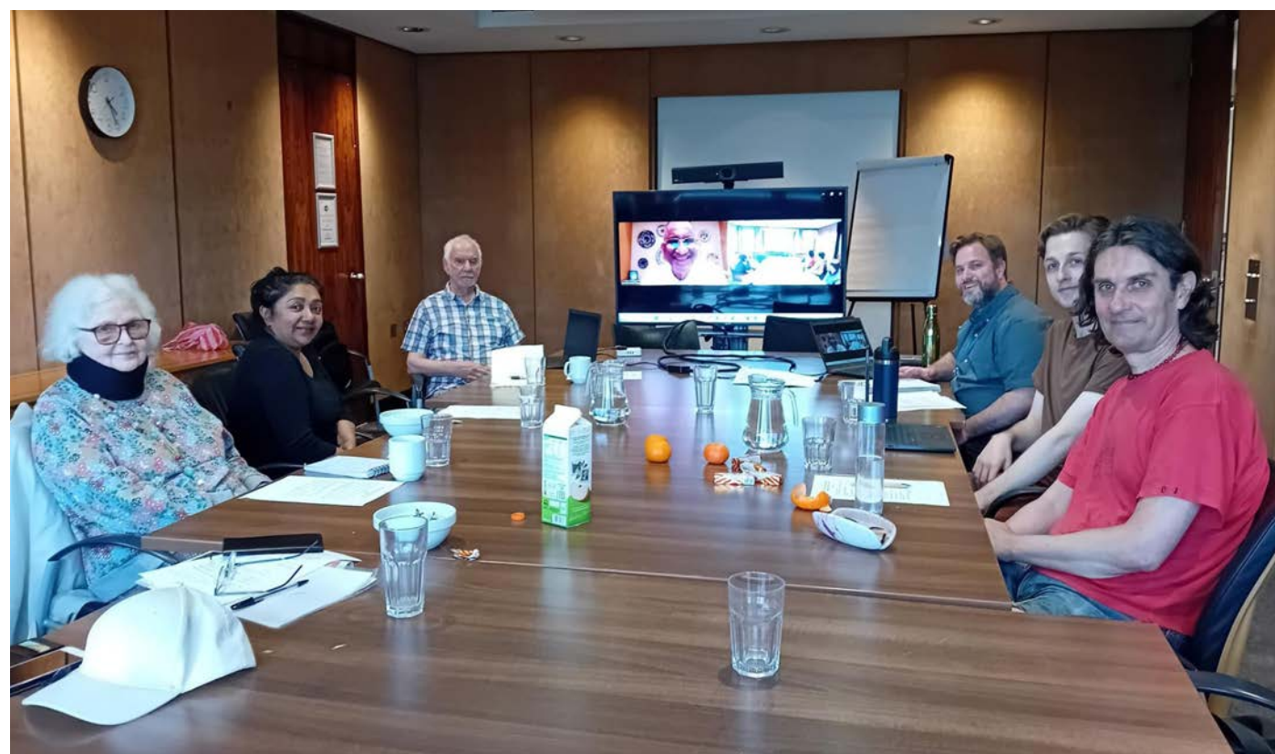
Thanks to the On the Edge advisory group