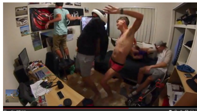
The Harlem Shake is an example of a current Buzz or Trend that has seen many videos posted online become 'viral'.

Try; www.google.co.uk , www.yahoo.co.uk , www.bing.co.uk .