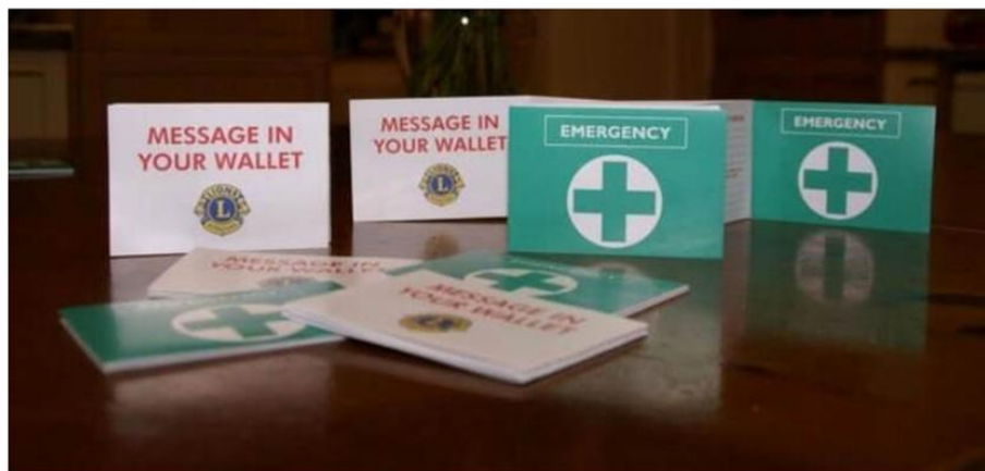
Lions Message in a Wallet

https://www.rosipa.com/home-safety/older-people-safety