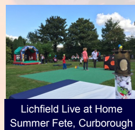
Lichfield Live at Home Summer Fete, Curborough