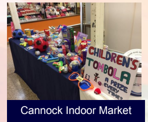
Cannock Indoor Market

For Health Information Week 3rd - 7th July 2017 Age UK SS had information stands and held a taster session of a seated exercise class with our Charity Partners at Cannock Shopping Centre.