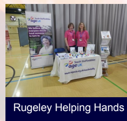
Rugeley Helping Hands