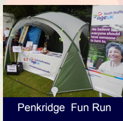
Penkridge Fun Run