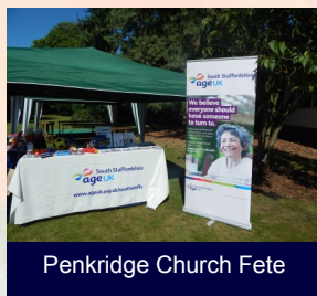
Penkridge Church Fete