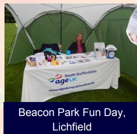
Beacon Park Fun Day, Lichfield