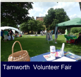
Tamworth Volunteer Fair