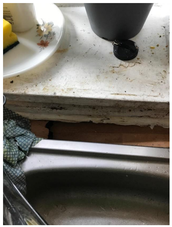
Image 3 - Mould in PRSNEWC1's kitchen made the preservation of fresh food impossible

The presence of damp and mould is a common feature in many homes in the UK, not just those in poor repair, and is a common theme in the literature that deals with housing quality (e.g. Liddell and Guiney, 2015; Butler and Sherriff, 2017). Our findings mirror this, as the conspicuous and persistent presence of damp and mould was by far the most commonly cited issue reported by respondents.