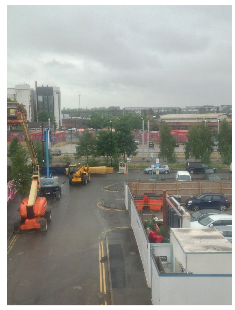
Image 9 - The noise from a construction site close to PRSMANC2's apartment was a source of stress throughout lockdown

I live next door to a seven-storey mill that has – so I live off a main road, but it has HGV access and I live on the end terrace, so basically I have lorries delivering to the mill anything from about 5:30/six o'clock in the morning till about 6:30/seven o'clock at night. (PRSMANC14, female, 44, lone parent)