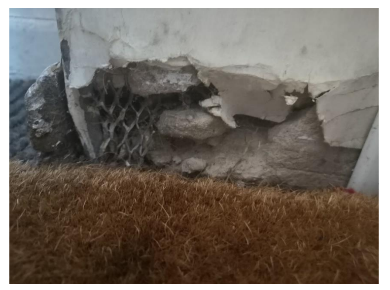
Image 7 - An example of PRSMANC6'S relatively minor disrepair which was had become increasingly frustrating throughout lockdown

described how living in poor housing conditions had the effect of exacerbating wider frustrations associated with lockdown and the pandemic itself.