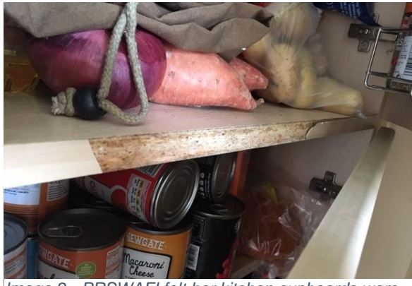
Image 2 - PRSWAFI felt her kitchen cupboards were practically unusable and required urgent repairs

With the exception of a minority of the sample, very little mention was made of any planned future repairs or investment by the household or the landlord (where relevant). Where there were plans in place, these were invariably on hold due to the challenges surrounding social distancing and virus transmission (see Chapter Four for more details). Owneroccupiers were able to exercise a little more choice about the nature of the improvements needed to their properties. However, it is worth noting that the