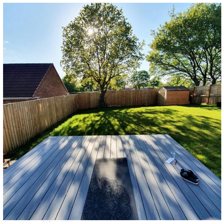
Image 10 - OOWAFI1 had turned to yoga to try and manage anxiety related to lockdown and the pandemic

Definitely meditation, being closer to nature, because I am really grateful for the big garden that I've got. (PRSMANC13, female, 36, lone parent)