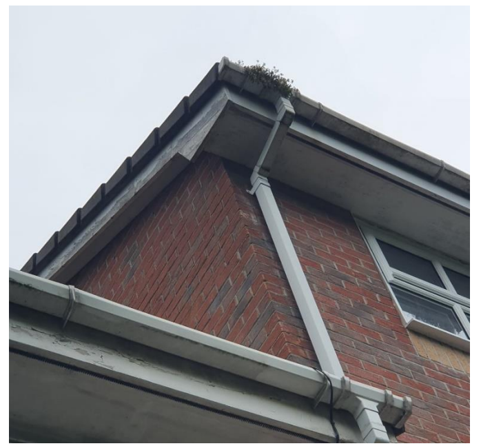
Image 1 - Image 1 - Leaks inside OOMANC2's dwelling were attributed to issues with her gutters

Encouragingly, there were few examples cited by respondents of serious safety issues involving gas or electricity. However, in terms of other significant issues, major factors tended to be roof leaks and general disrepair (including chimney deterioration), gutters that were causing water to penetrate the dwelling in some way and general disrepair in the immediate outdoor environment (i.e. yards or gardens). Leaks from roofs and guttering were reportedly the root cause of a variety of issues for many respondents, with people coping with damp and condensation within the property, which caused further internal decay.