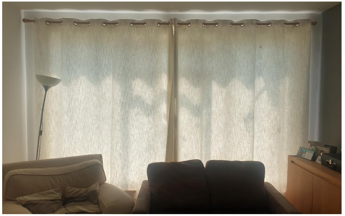
Image 6 - OOBOLT1's attempts to control thermal comfort and limit overheating

Whilst for the majority of the sample the focus of their thermal comfort had been on coping in cold homes, it should be noted that in a small minority of cases respondents did experience overheating of their home, which was thought to be caused by poorly insulated walls and solar gain from single-glazed windows.