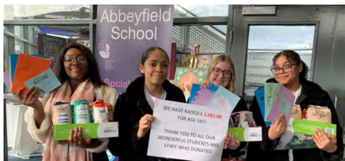
Thank you to students at Abbeyfield School

We are grateful to everyone for their generosity and kindness to local older people. There is not the space to thank everyone here, so please follow us on Twitter, Facebook and Instagram for details.