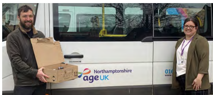
Thank you to Avon for the essential supplies