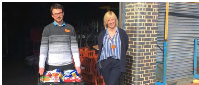
Thank you to Sainsbury's in Northampton