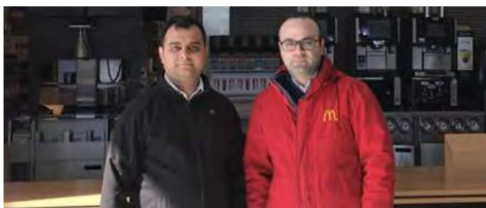
Thank you to McDonalds at junction 15a on the M1

Our Venton Centre in York Road, Northampton is open Monday to Friday, 8am - 3.30pm to receive donations of food and essential items. Please visit our website to make an online donation to our Covid-19 Emergency Appeal.