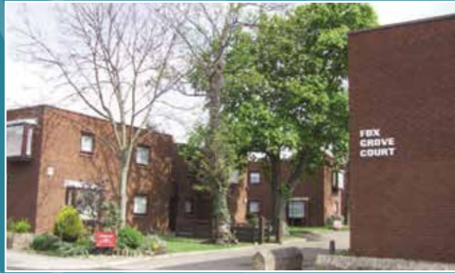
Fox Grove Court, Basford