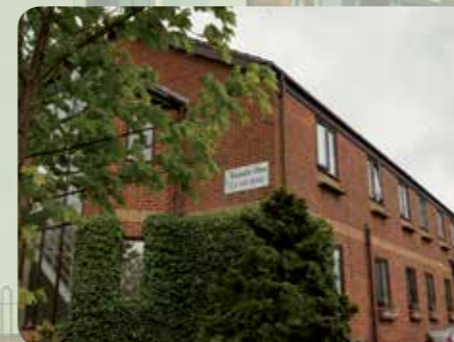
ALEXANDRA HOUSE Eastwood, NG16 3GP