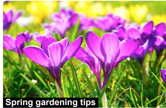
Spring gardening tips

The bright and inviting colours of newly blooming flowers are one of the most iconic images of spring, but any gardener can tell you that the best gardens take time and care to cultivate. Here are our three top tips for creating a beautiful spring garden