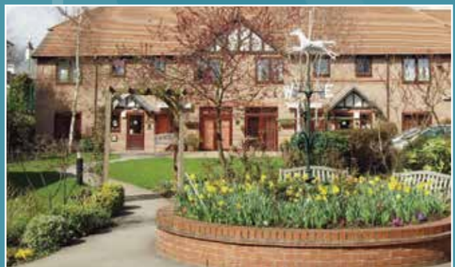
Spencer Court, Sherwood Rise