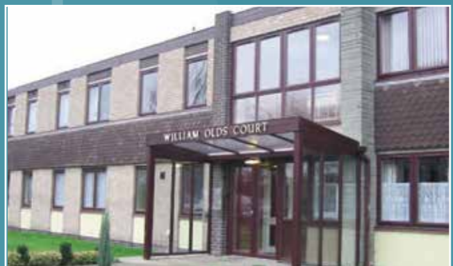
William Olds Court, Wollaton

Mansfield Road Baptist Housing Association Ltd has over forty years experience of providing quality apartments for the elderly.