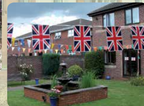
MELBOURNE HOUSE Aspley, NG8 5RU