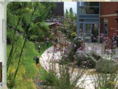
BELLE VUE LODGE Mapperley, NG3 5FS