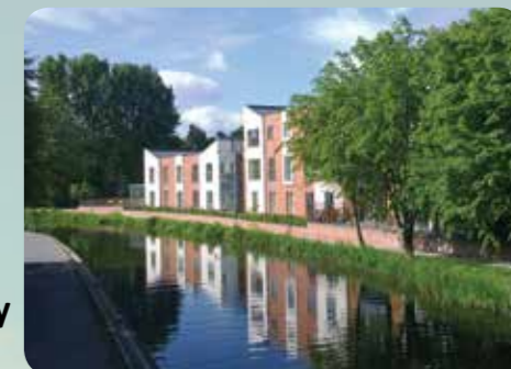
Our latest home is CANAL VUE Ilkeston, Derby DE7 8JF