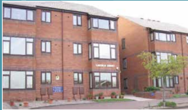
Lincoln Court, Bilborough