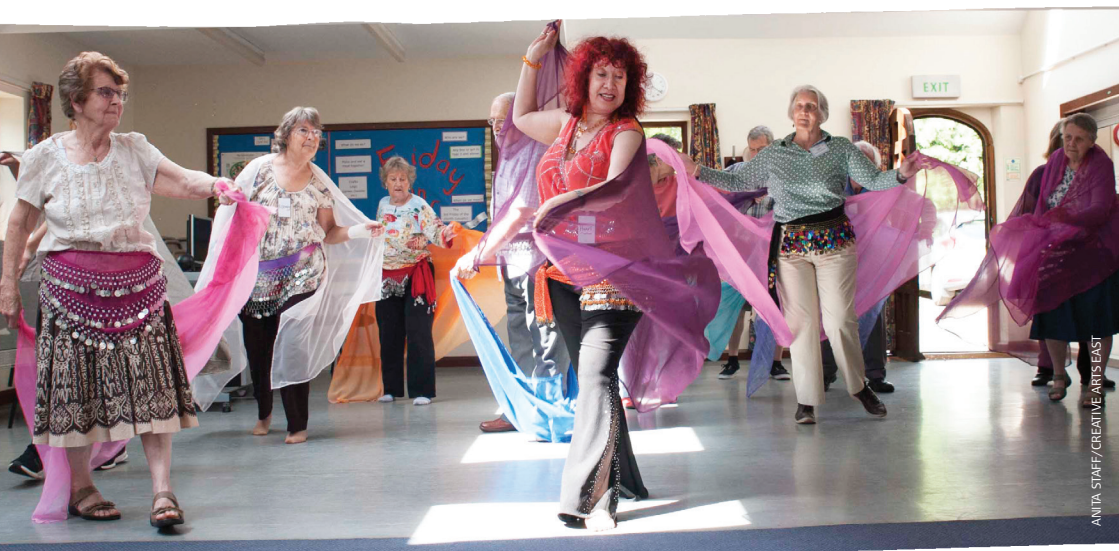
ANITA STAFF/CREATIVE ARTISTS EAST

To find out more about the Festival visit www.ageofcreativity.co.uk/festival , join us @ageofcreativity on social media or contact your local Age UK.