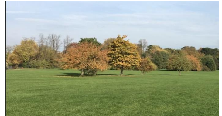
The home looks out on to Oxford's beautiful South Park

Homeshare Oxfordshire carefully matches an older person, or couple, looking for help, companionship or reassurance at home, with another person who is happy to lend a hand, and who needs low-cost accommodation. The Sharer gives the Householder up to 10 hours of their time each week as a combination of companionship and practical help, as agreed. Each party pays a monthly fee to Homeshare Oxfordshire.