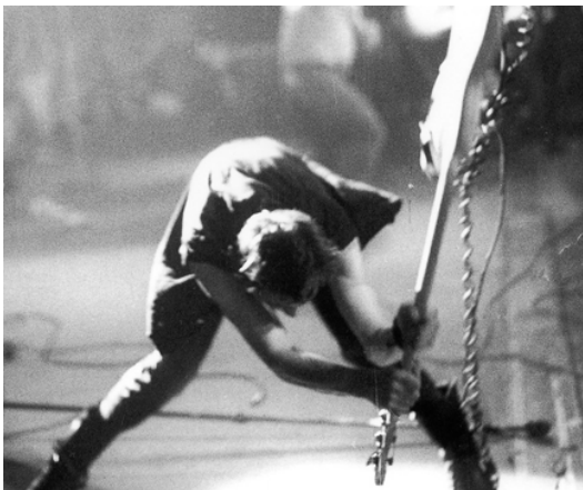
The Clash -London's calling