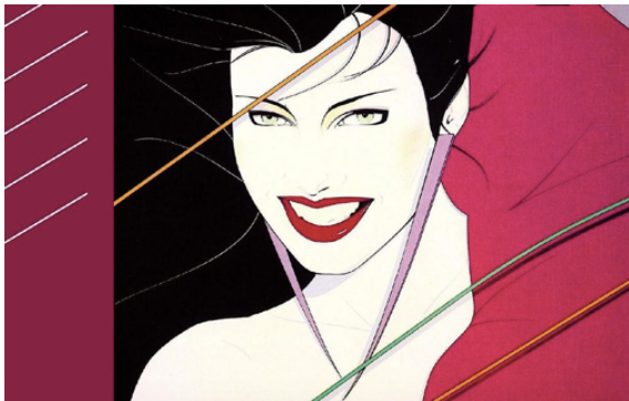
Duran Duran- Rio