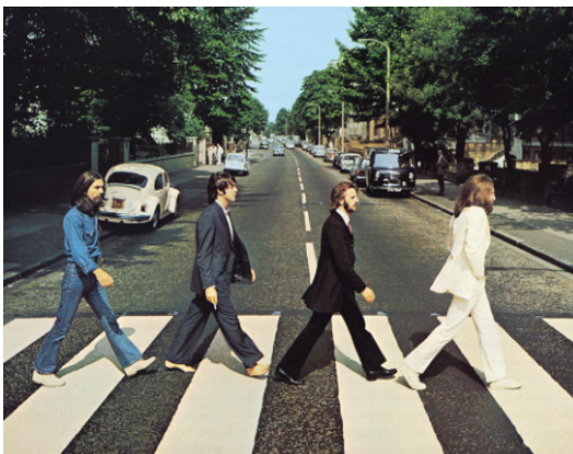
The Beatles- Abbey Road