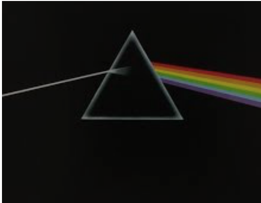
Pink Floyd- Dark Side of the Moon