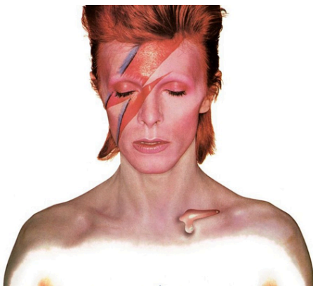
David Bowie- Aladdin Sane