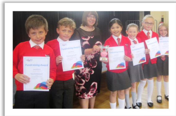
We will present the winning team/pupil/class or the school generally with a certificate and trophy at the end and provide the school with a receipt/thank you letter.