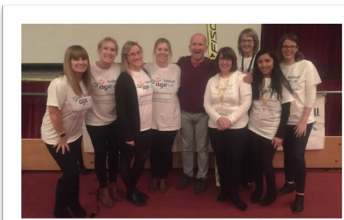
Eddie the Eagle (centre) with Age UK Solihull staff and volunteers