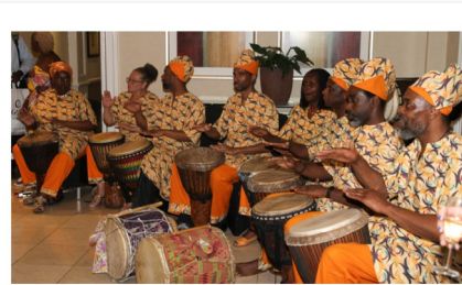
(above) African Drumming Band: Tewahedo Drummers

Thanks to all guests, sponsors, suppliers and volunteers for supporting the Ball.