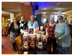
Distributing the Easter eggs at Club TLC

Birmingham Business Park chose us as their Charity of the Year 2018/19, and we're delighted that they have decided to extend the partnership