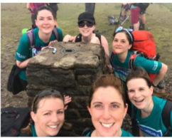
The Peak Climbers setting off