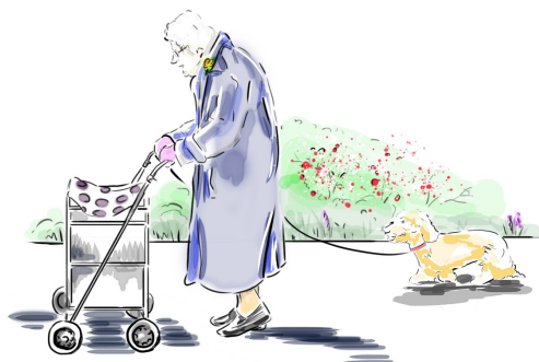
Illustrations by Meghan Allbright

Many older people in Solihull are experiencing loneliness , isolation , health issues , worries about money and bills , or struggles with daily tasks .