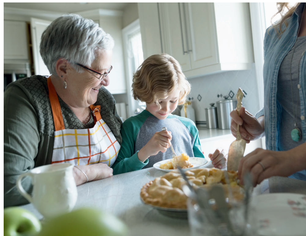
Representative of a typical in-home display.

A leaflet from Smart Energy GB, the independent voice of the smart meter rollout.