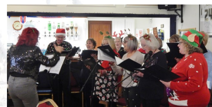
Cheslyn Hay Community Choir