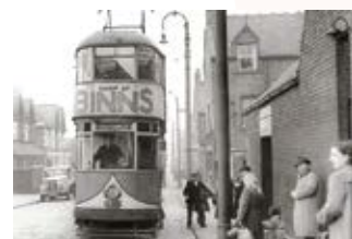
Villette Road circa 1950