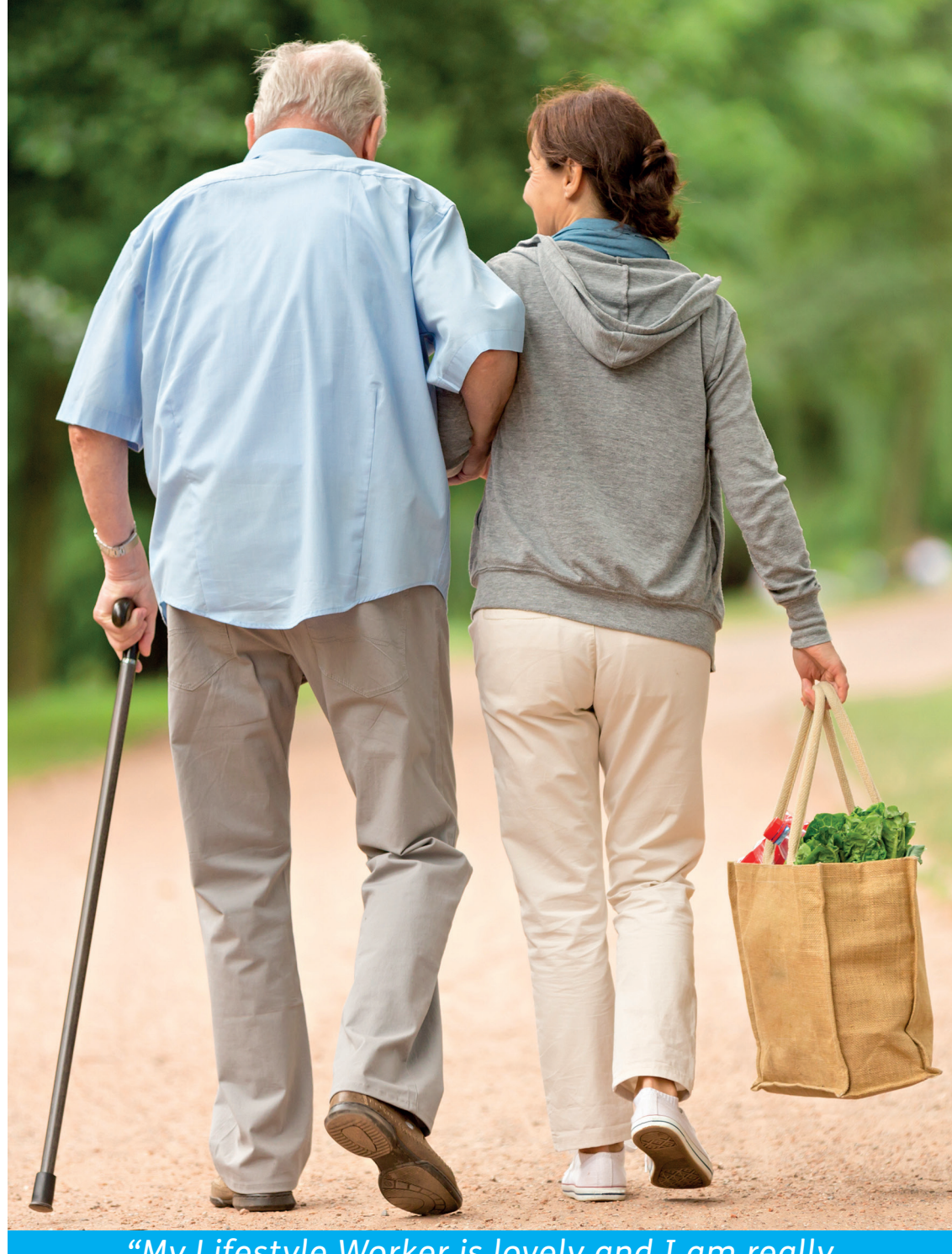
"My Lifestyle Worker is lovely and I am really pleased with the work she does for me"

The service is only operational Monday to Friday between the hours of 9.00 am and 5.00 pm.