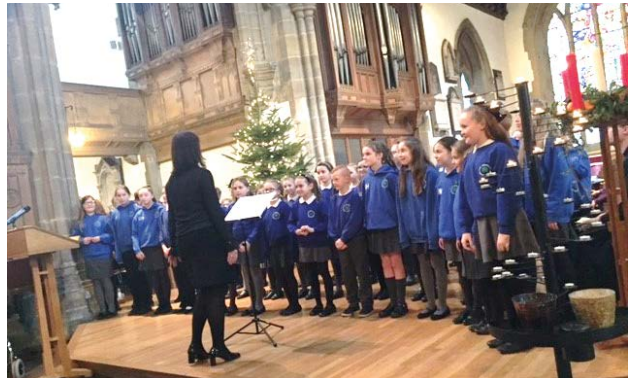
East Herrington Primary Academy Choir