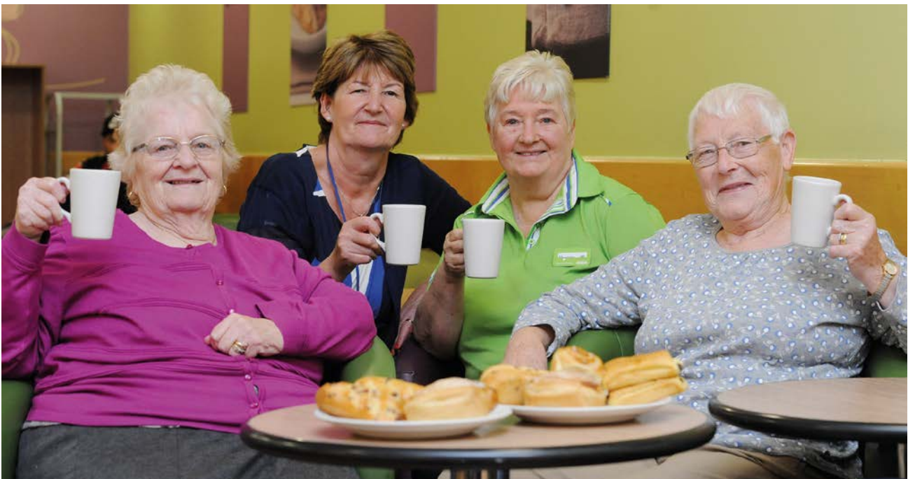
Coffee Morning – Asda