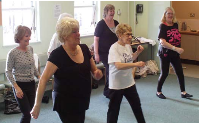
Some of our Activage courses and classes