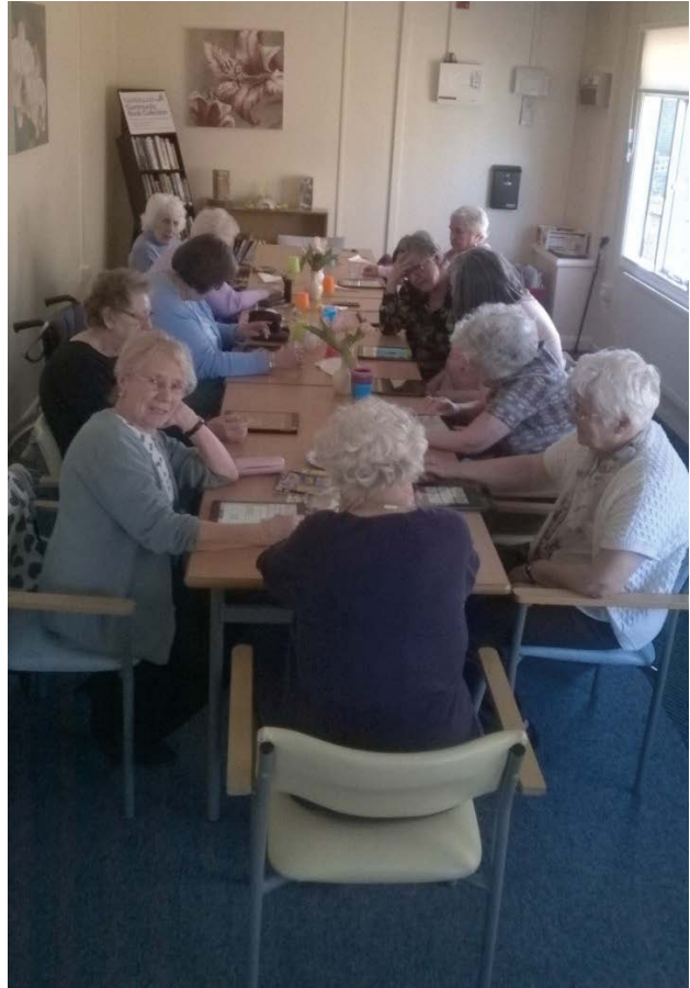
Learning about I pads in the Coalfields area

ASDA in Washington kindly host our promotions stand every month and this has been a very useful way of promoting the products and services, engaging new volunteers, as well as promoting the specialised services that Age UK Sunderland has to offer. We regularly receive up to 100 enquiries a day at these sessions.