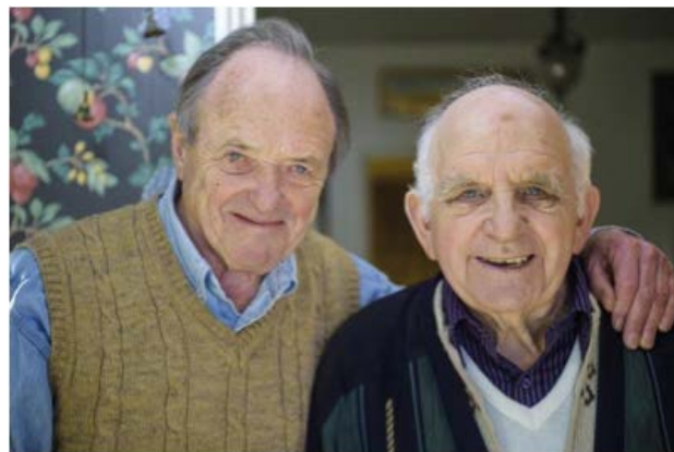
North East actor James Bolam supporting the campaign

our befriending service which provides regular weekly phone calls and visits to lonely older people. Two videos made with the support of actors Miriam Margolyes and James Bolam told the stories of two people and were aired on national TV.