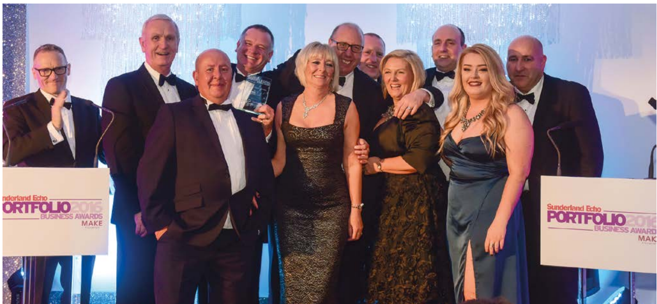
The staff at Station Taxis collecting their award at the Sunderland Echo Portfolio Business Awards