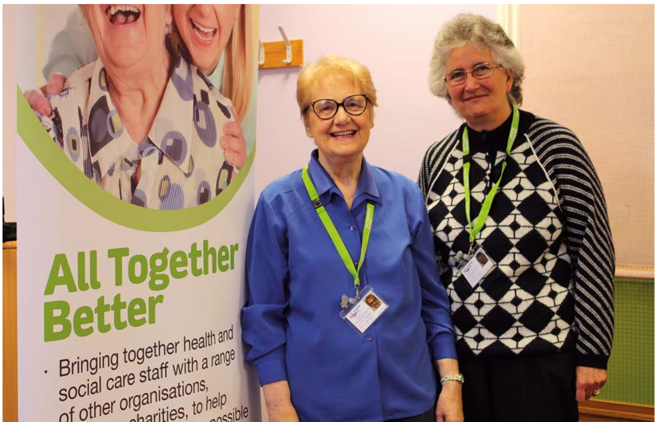
Some of our dedicated PPCE volunteers

In order to target the more appropriate groups, and focussing on the top 3% of those with the poorest health in the city, the team has worked to coordinate the recruitment, training and deployment of a number of All Together Better Volunteer Champions.