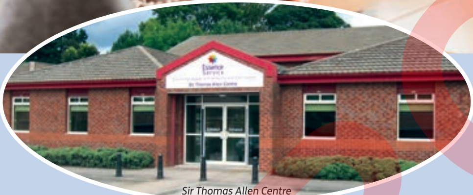
Sir Thomas Allen Centre