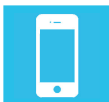
Donate via Text