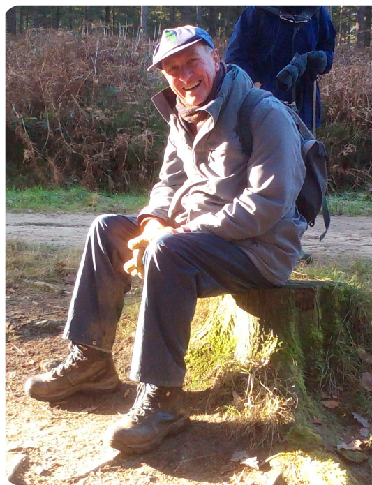
Clive GO50 Walk Leader

Given the nature of the programme there are many different types of walk available. We run a dedicated health walk from Merrow leaving every Thursday from St. John's Centre at 9:45. Walkers are encouraged to walk at a pace that suits them. Ideally this pace means you will feel slightly warmer, breathe a little faster and increase your heart rate... (continued on page 2)