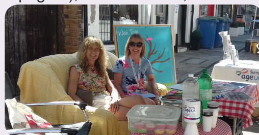
Last year's Great Get Together in Guildford

As an independent local charity we provide all of our own services across Surrey. We work hard to combat loneliness among older people, so if you or somebody you know ever feels lonely please do get in touch.